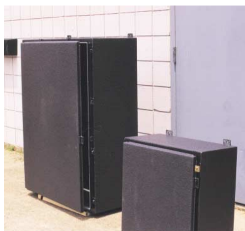
Rhino Linings provide Environmental Protection