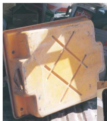
Rhino Linings provide Corrosion and Abrasion Resistance