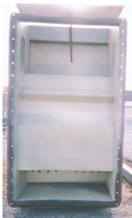
Rhino Linings provide Corrosion Resistance