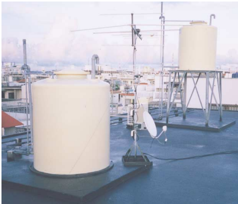
Rhino Linings provide Environmental Protection and Corrosion Resistance